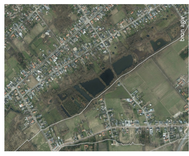
Aerial photograph by Dauteweyers (Diepenbeek): Open space fragment in peri-urban context with high ecological potential.